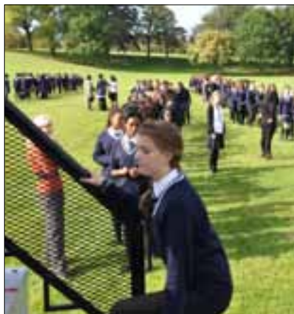
One by one...