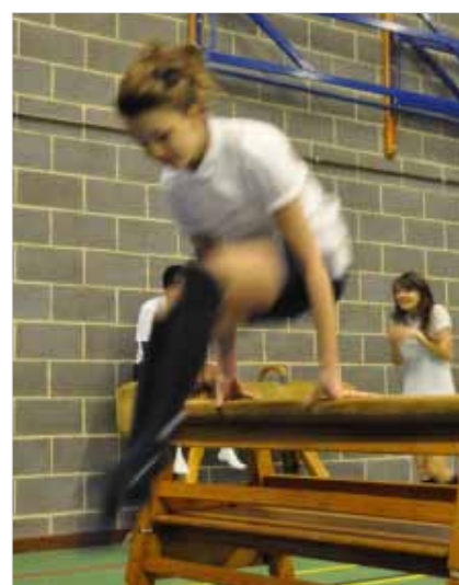
Free running (Parkour)