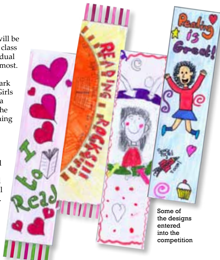
Some of the designs entered into the competition