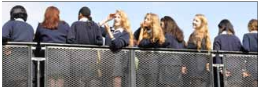
Who's that turning up late...