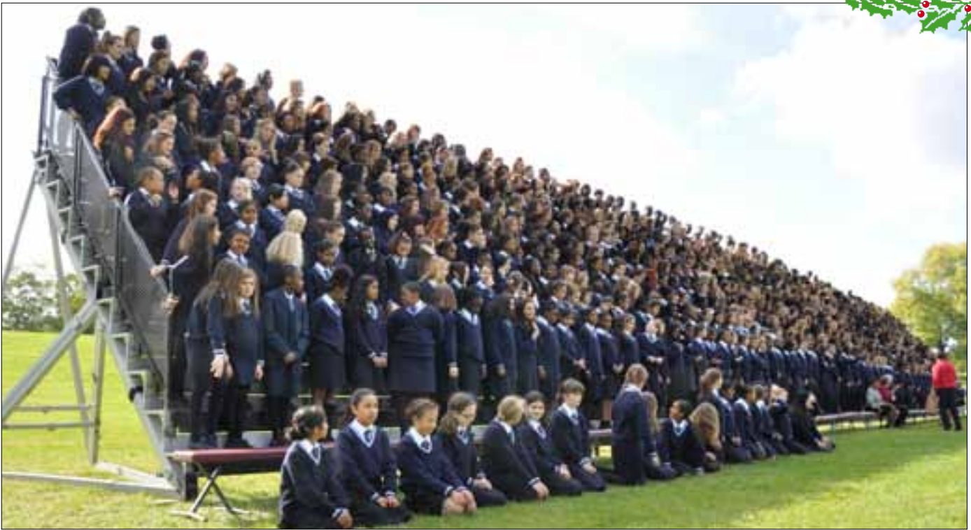
Last of the Year 7s take their places....awwwwww... they're so cute...