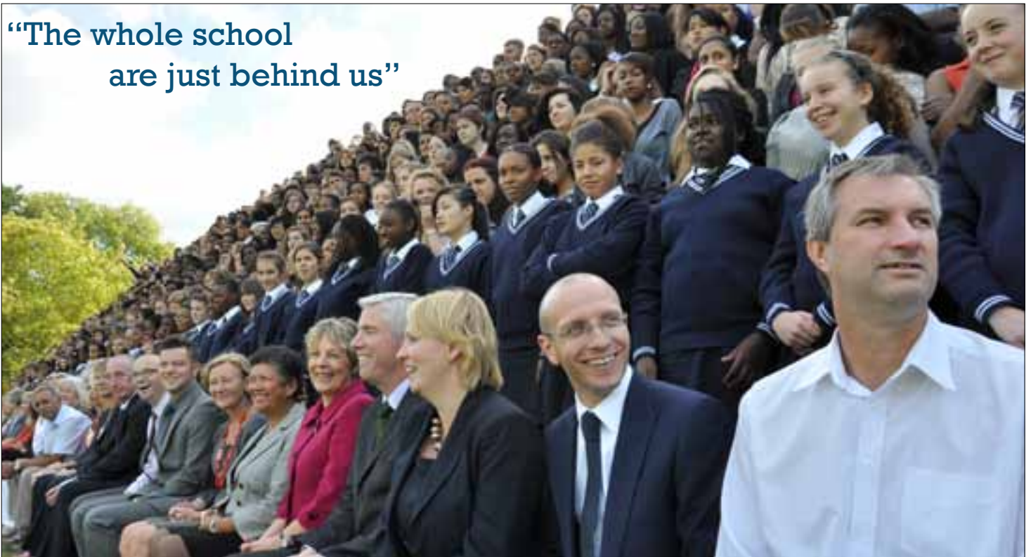
Only a few minutes to go