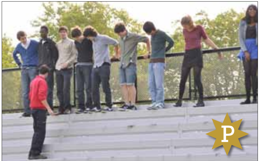
Well done to the first 9 Sixth Form students who stood at the top for over an hour